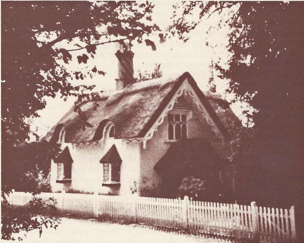
A TYPICAL COTTAGE IN THE BEAUTIFUL VILLAGE OF OLD WARDEN

We suggest that those who joined the circuit at Cardington, also take this turn in order to visit the church and find out more about the area.