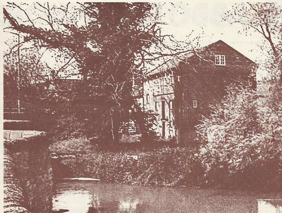
BROMHAM MILL FROM THE RIVER BRIDGE