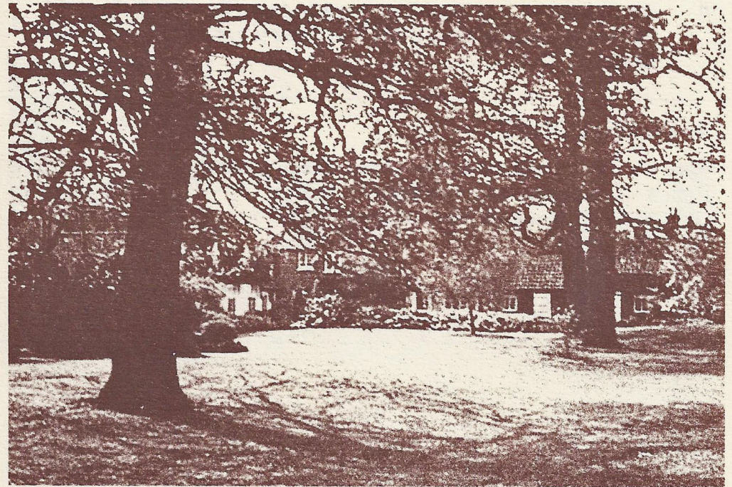
A RURAL SCENE AT THE HEART OF BIDDENHAM VILLAGE