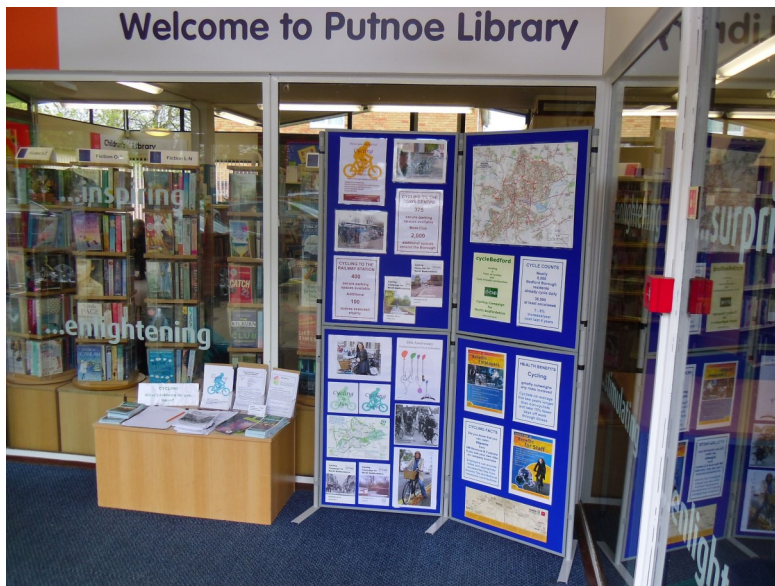
Putnoe Library Exhibition 23 April to 4 May 2012

To celebrate our 20th anniversary in 2012, displays were put on in Putnoe and Kempston Libraries and during Bike Week also in Bedford Central Library.